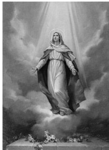
SOLEMNITY OF THE ASSUMPTION OF THE BLESSED VIRGIN MARY— AUGUST 15

This month features the Solemnity of the Assumption of the Blessed Virgin Mary. This solemnity