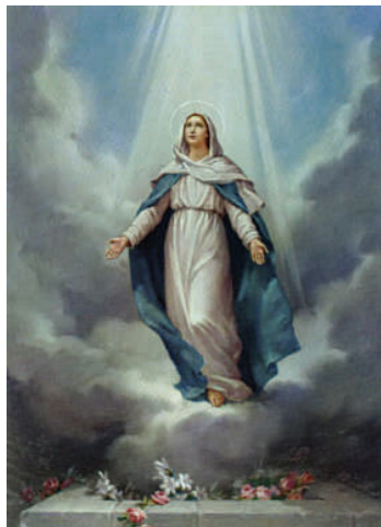
SOLEMNITY OF THE ASSUMPTION OF THE BLESSED VIRGIN MARY— AUGUST 15

This month features the Solemnity of the Assumption of the Blessed Virgin Mary. This solemnity