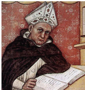
ST. ALBERT THE GREAT FEAST DAY—NOVEMBER 15

This month features the feast of St. Albert the Great, a Dominican friar born in 1206 in Lauingen along the Danube River. He was a scientist before the age of science and was considered a wizard and magician. He became the teacher and mentor of another remarkable mind: St. Thomas